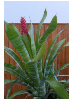
Aechmea phanaerophlebia