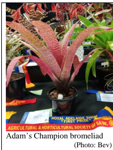
Adam's Champion bromeliad