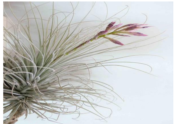
T tectorum