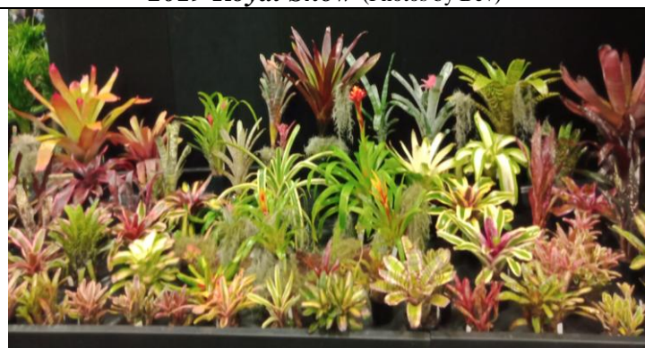
Our display created by Adam