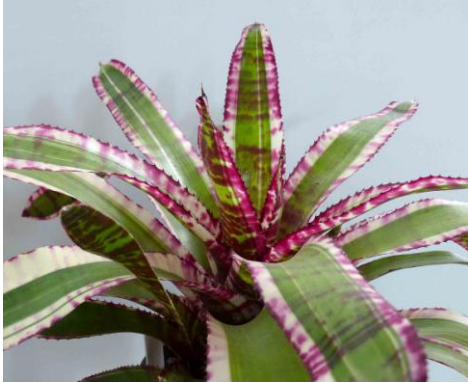
Neoregelia 'Bottoms Up'