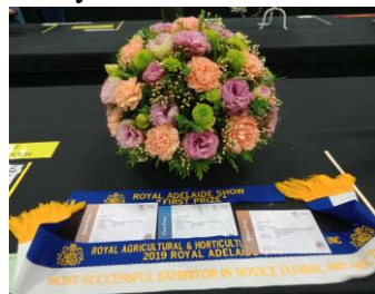
Champion Novice

Many thanks to the dedicated volunteers supporting this. Bev