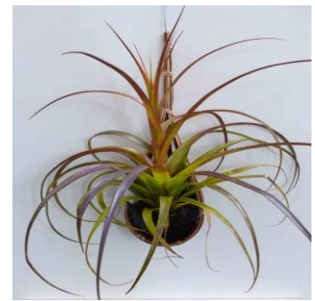
T. variabilis