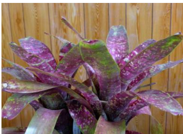
Neoregelia 'Sweet Chilli'

I was intrigued that so many tried to get a scent from the Tillandsia duratii . I know the formal description says fragrance but would feel it would need a biological trigger such as light intensity or temperature. Whatever the reason the flowering plant made the day enjoyable.